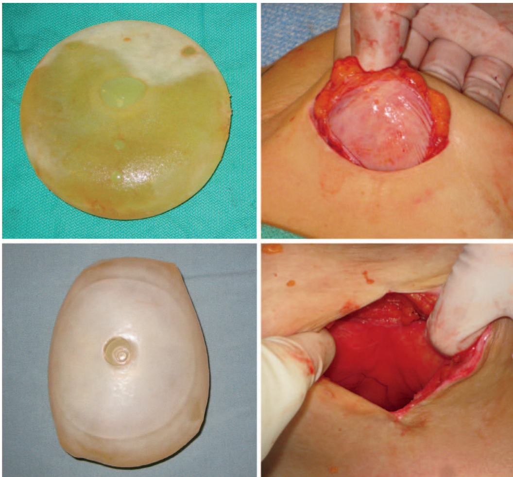
Fig. 2. (Above) A double capsule after breast augmentation with an Allergan Biocell textured implant. This patient presented with late seroma in the contralateral breast. (Below) A double capsule after breast augmentation–vertical scar mastopexy with a Mentor Siltex textured implant. This patient presented with grade III capsular contracture in the ipsilateral breast.

The exact developmental mechanism and risk factors for double capsule and its relationship to late seroma are yet to be elucidated. It appears that textured implants are more commonly associated with development of both double capsule and late seroma compared with smooth implants. Although several authors 95,102 have speculated that the Biocell texturization process may play a significant role in the development of double capsule