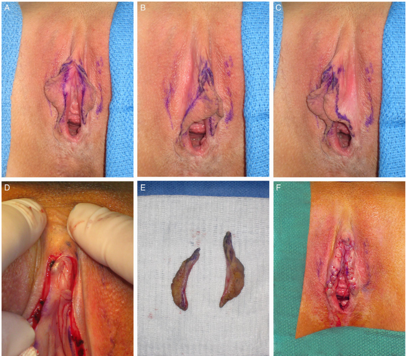
Figure 1. This 29-year-old woman presented with labial hypertrophy. Preoperative markings for labia minora reduction and clitoral hood reduction show (A) the medial aspect of labia minora; (B) the lateral aspect of right labia minora; and (C) the lateral aspect of left labia minora. (D) Appearance after excision of labia minora and clitoral hood skin. Note the midline skin bridges preserved on the clitoral hood. (E) Excised skin of labia minor and clitoral hood. (F) Closure of labia minora and clitoral hood with a continuous 4-0 Vicryl rapide vertical mattress type suture.

the appearance of normal anatomy. 35-45 This criticism is inherent in the recommendations issued by organizations such as the ACOG and SOGC when they suggest that physicians educate and remind women of the variations in normal appearance. 35,37 Plastic surgeons who were practicing in the early days of breast augmentation remember the very same comments being made by those critical of patients with the desire to make their normal breasts appear larger and/or more attractive. While it is important for plastic surgeons to stress that a patient demonstrates a variance of normal when this is the case, it also needs to be